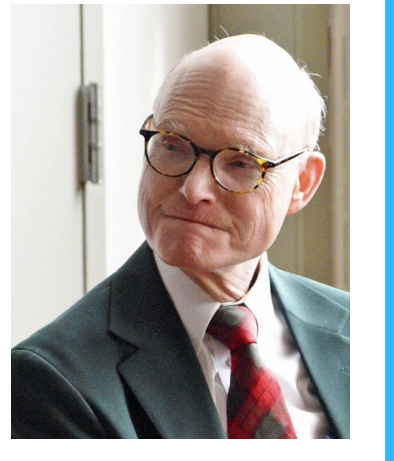
...made somehow more devilish by 50 years in Arkansas.